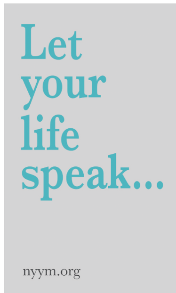
FRONT Version 2